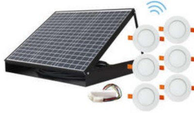
Multiple Solar Lights System