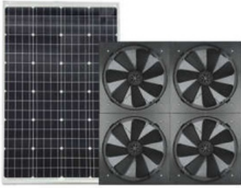
Multiple Solar Fans System